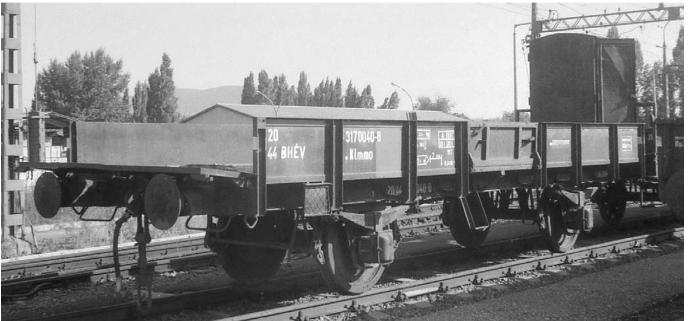
20 44 BHÉV 3170040-8 •Klmmo, with brakers cabin. Szentendre 25.06.1990