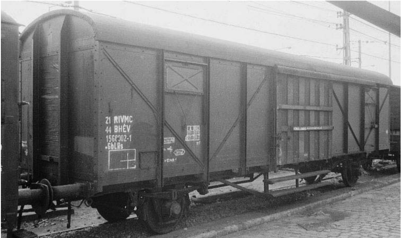
21 44 BHÉV 1568002-1 •GbLRs, with air brake Hik-GP. Peterszebet 25.06.1990 Markings say load limit 20,0 t and floor 28,5 m 2. Both are wrong - should be 22,0 t resp. 30,0 m 2.